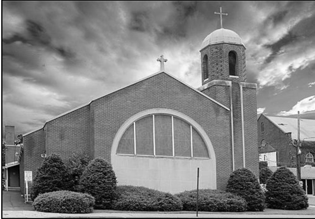
A publication of St. Nicholas Greek Orthodox Church in Youngstown, Ohio